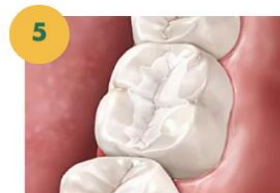
5 Final sealant result