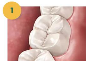
1 Tooth without sealant