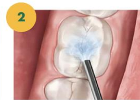
2 Tooth cleansed and dried