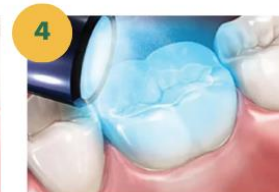
4 Curing light hardens sealant