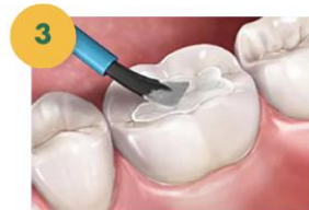
3 Liquid sealant is applied